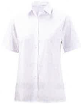
White Dress Shirt (short or long sleeved)