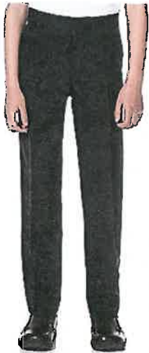
Black Dress Trousers