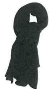
Plain Black Scarf