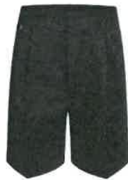
Black Dress Shorts