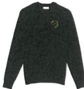
Black Woollen Jersey with school crest