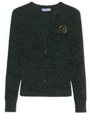
Black Woollen Cardigan with school crest