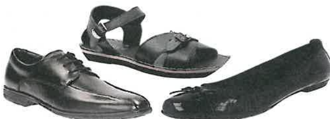
Plain Black Shoes

Laces and soles must be black. Shoes must be under the ankle (no boots).