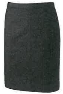
Black Knee length Skirt (knee Length)

Must be worn when on out of school trips