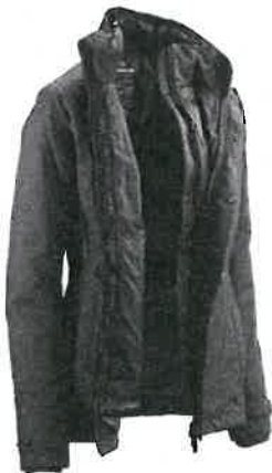
Black Jacket or approved Kidscan Jacket