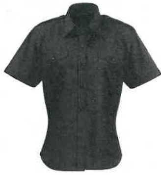
Black Dress Shirt (short or long sleeved)