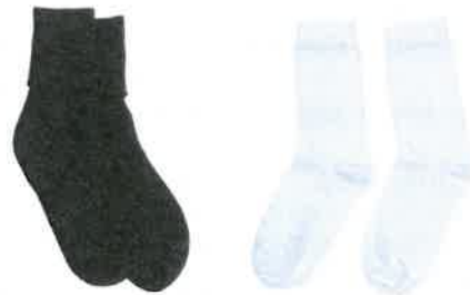
White or Black Socks (knee or ankle length)