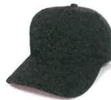
Plain Black Cap or Beanie (school logo optional)