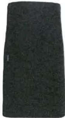
Plain black le Faitaga